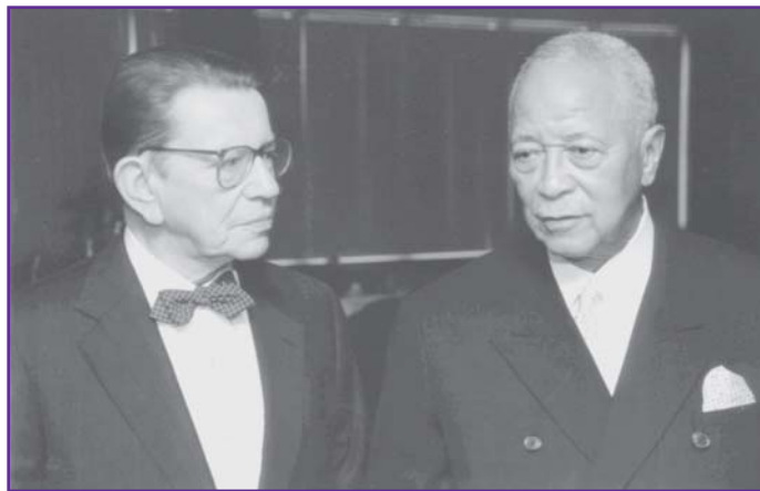
Paul Simon and David Dinkins, former New York mayor.