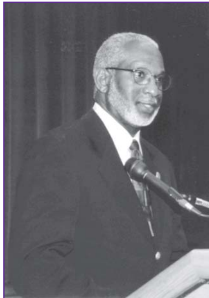
David Satcher, former U.S. surgeon general.

Representatives from the mental health and corrections fields as well