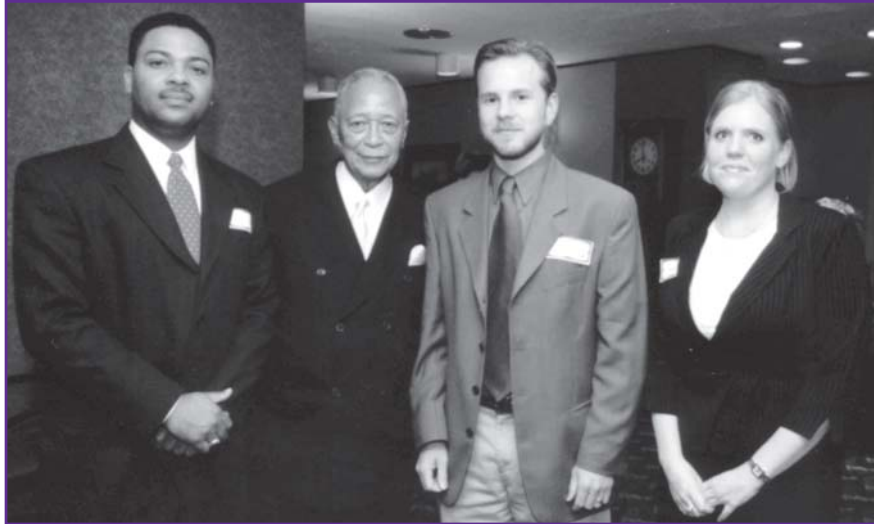
Former New York Mayor David Dinkins (second from left) met with MPA students during his SIUC visit.