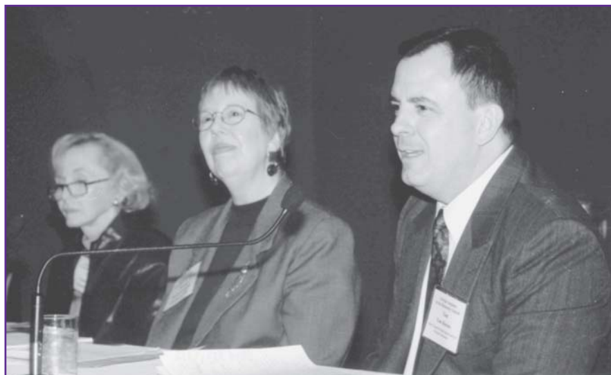
Members of the working group discuss foreign language recommendations.