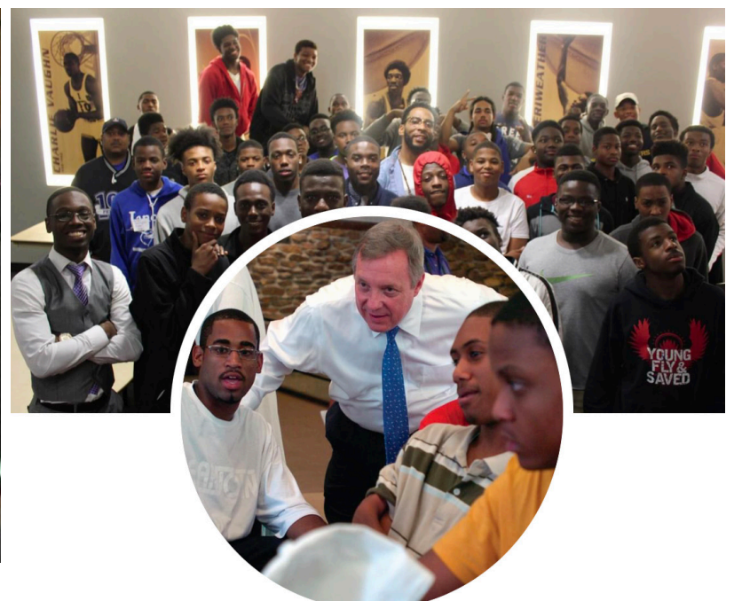
SENATOR DICK DURBIN SHARES THE VISION WITH YOUTH.