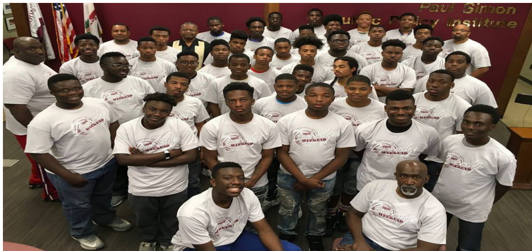
MENTORS AND STUDENTS FROM ACROSS THE METRO EAST AREA.