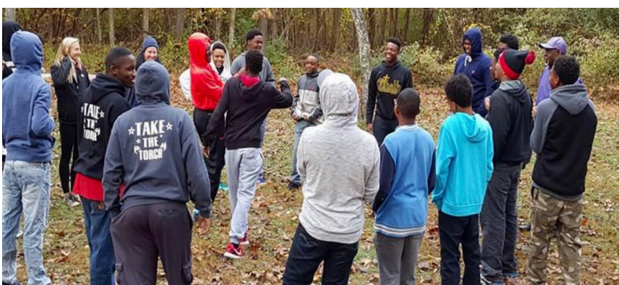
YOUTH TRAINING WORKSHOP: ON TEAM BUILDING